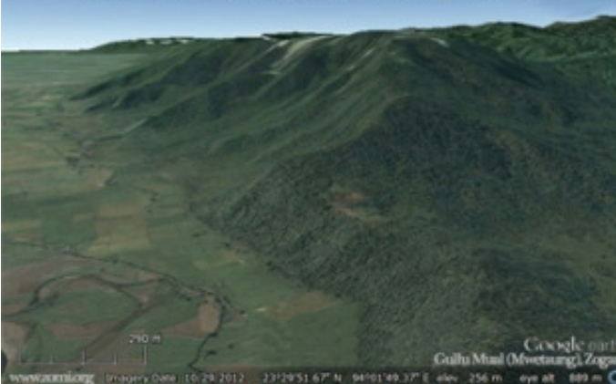
Gullu Mual in Chin State

In response to a question raised in Amyotha Hluttaw sessions by a Chin MP on 26 September 2011, Union Minister for Mines U Thein Htaik said the Mineral Exploration Corporation of the Ministry of Mines conducted tests for chromites at Mwe Hill region of Tiddim [Tedim] Township in Chin State in 1965-66 and the Geological Survey and Mineral Exploration Department in 1973, 1982 and 1999.—By Khaipi #