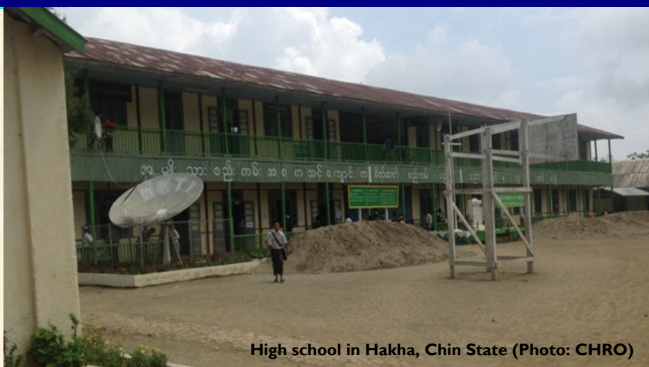
High school in Hakha, Chin State