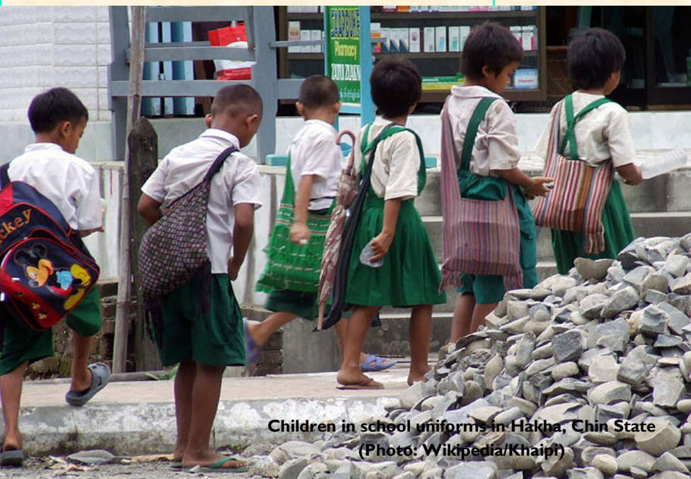
Children in school uniforms in Hakha, Chin State