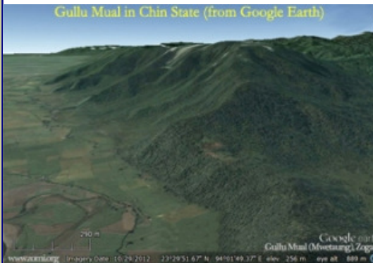
Gullu Mual in Chin State (from Google Earth)