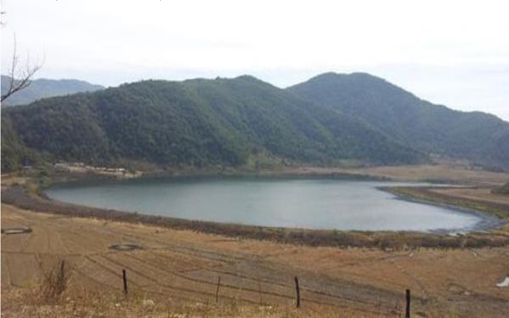
Rih lake

The letter, according to Pu Dawla, also urged NLD office in Hakha to push the Falam District Administration Office not to follow the orders issued by the government but to return the plots to local communities.