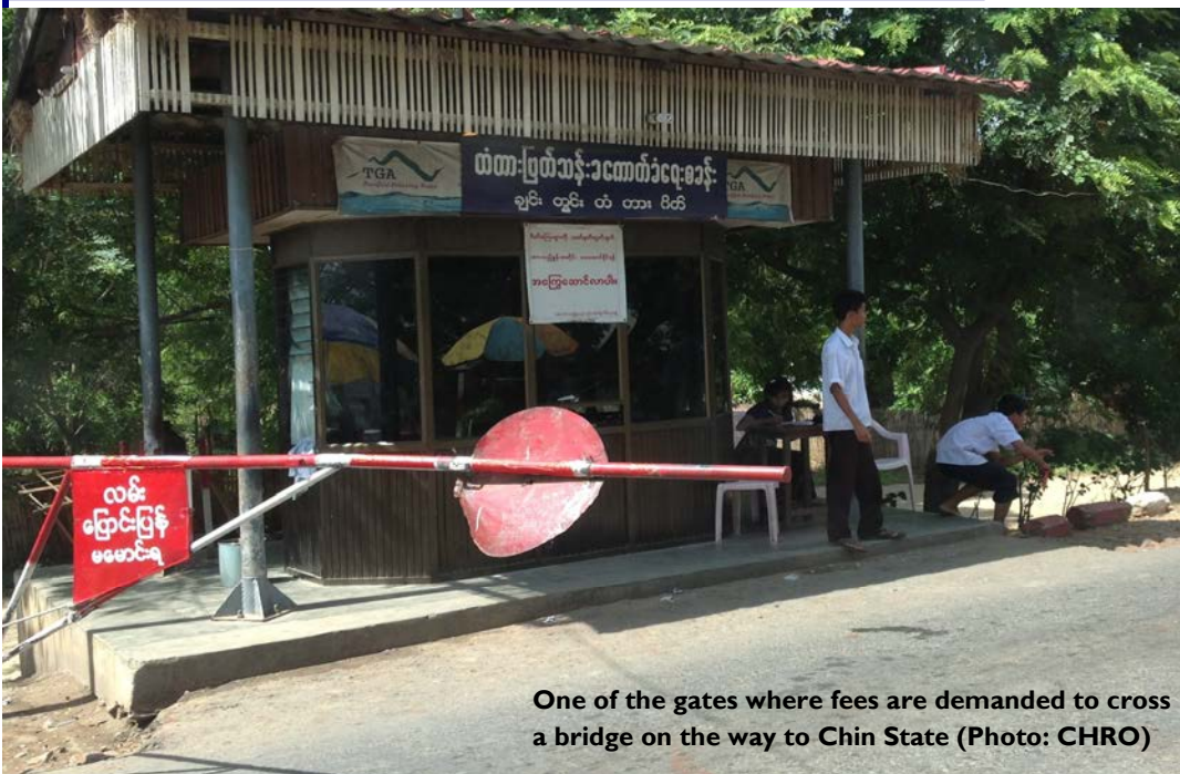
One of the gates where fees are demanded to cross a bridge on the way to Chin State

"A new custom check gate in Haimual village of Tedim Township, however, collects an extra 8,000 kyats besides the toll fee by claiming it as labour charge, - a local driver