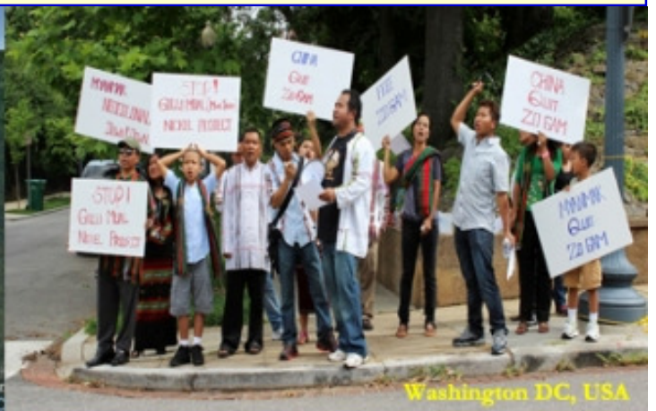
Washington DC, USA