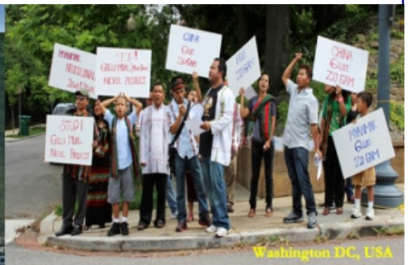
Washington DC, USA