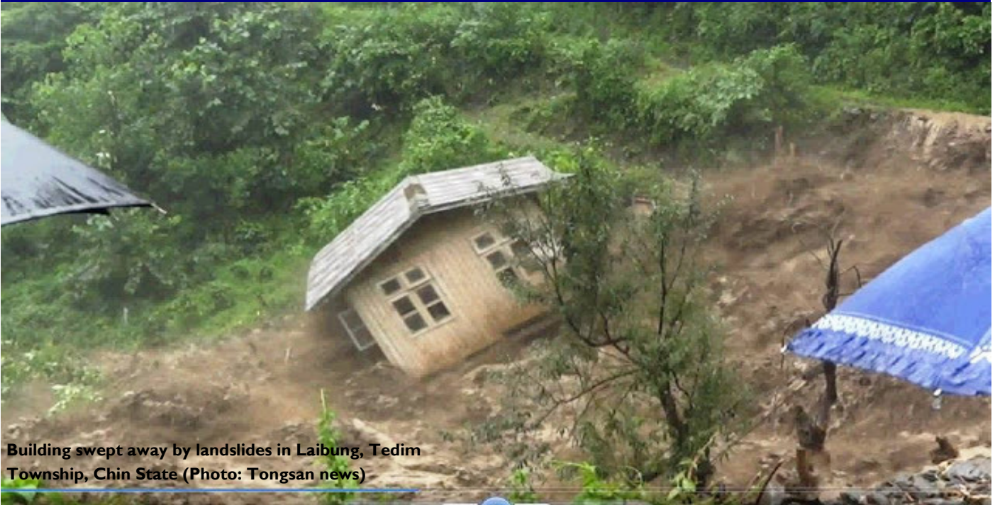
Building swept away by landslides in Laibung, Tedim Township, Chin State