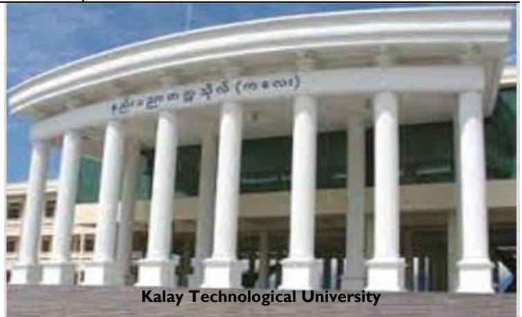
Kalay Technological University

The local people from both villages spent about six days in total to put out the forest fire. #