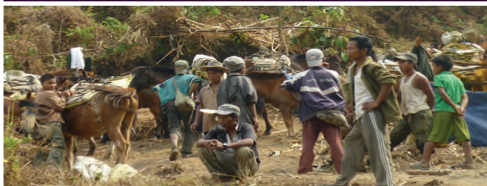
Horses used to carry heavy loads in Chin State