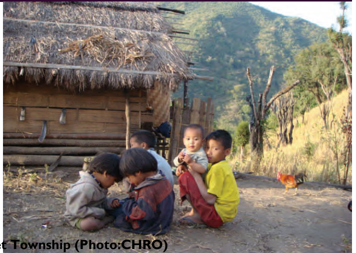
Chin villages in Kanpetlet Township