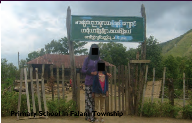
Primary School in Falam Township

"In our village tracts of Zawngte, each family was asked by force to contribute 300 Kyats and the collected money was submitted to the Falam Office on Tuesday," continued the villager.