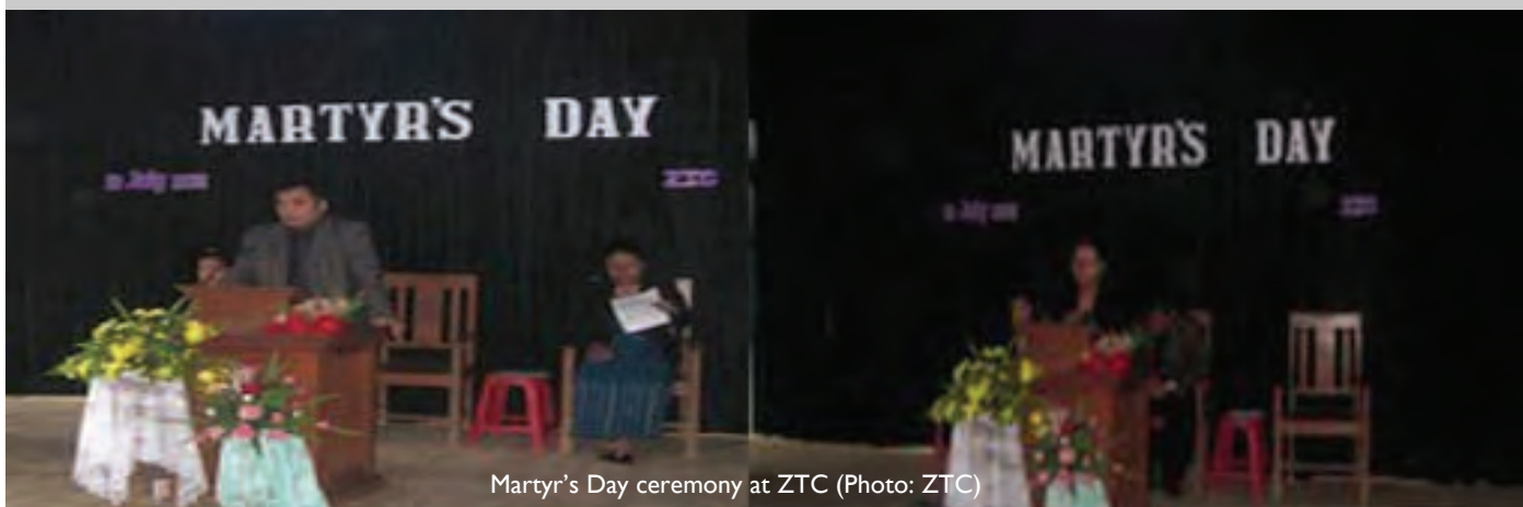
Martyr's Day ceremony at ZTC