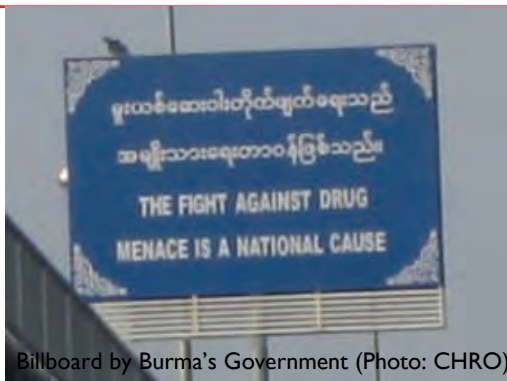
Billboard by Burma's Government

About 1,000 acres of land are made for poppy cultivation in northern Chin State, for which the military authorities have collected taxes from the locals