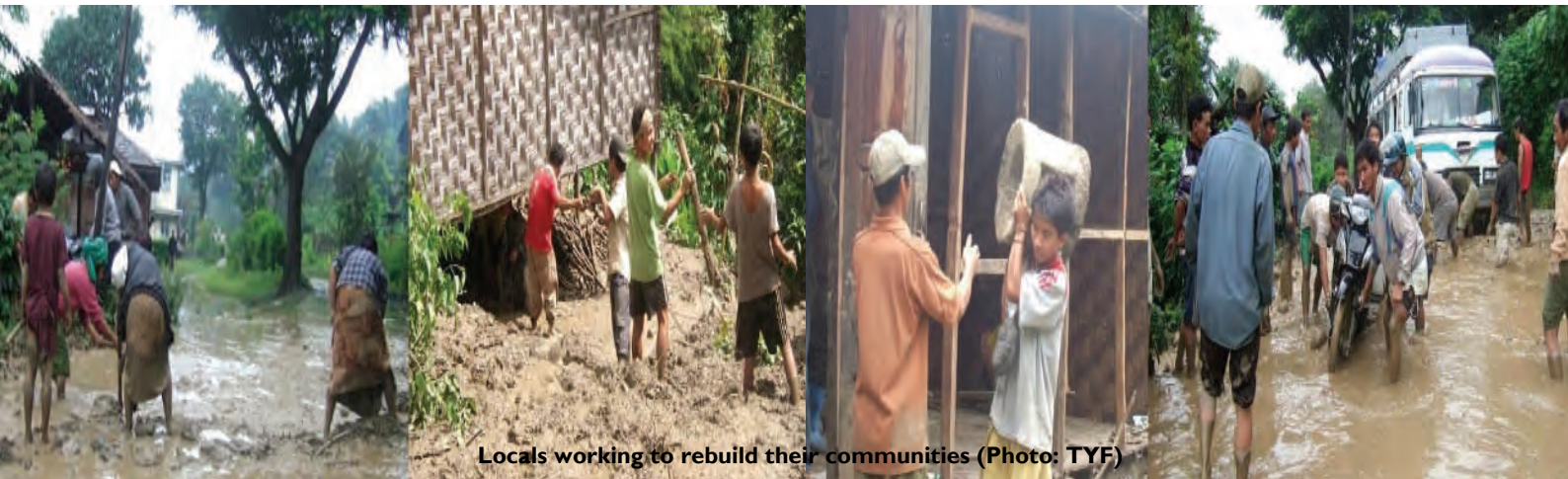
Locals working to rebuild their communities

Many towns and cities across Burma have been hit by torrential rains early this month.#