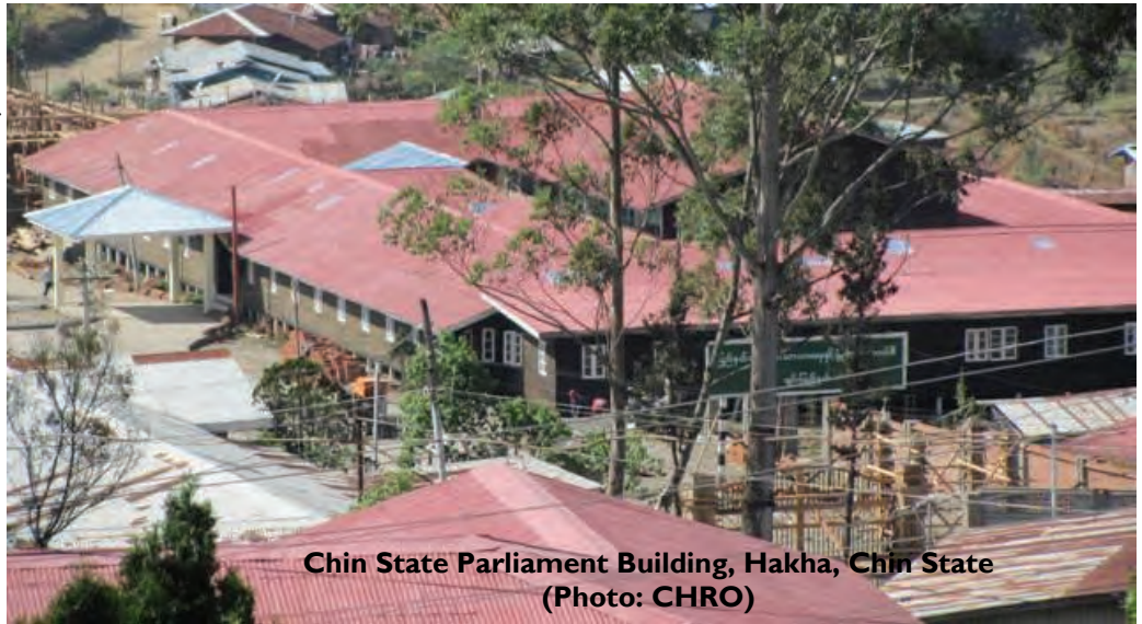
Chin State Parliament Building, Hakha, Chin State

"We have heard about the meeting to be called soon. But no officer letters have been circulated. And we