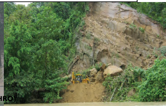
Floods in Kalay District, Sagaing Division