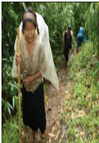
The way porters are carrying military rations in Chin State

The students said they didn't know what was inside the rucksacks, but judging from the weight they believed that it was ammunition. #