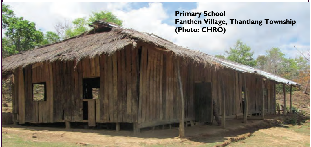
Primary School Fanthen Village, Thantlang Township

"Each student got only four notebooks and we just had to do it or else our salary would be cut at the end of the month," added the school teacher. #