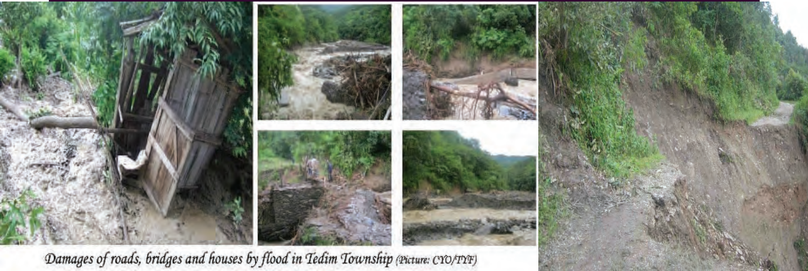
Damages of roads, bridges and houses by flood in Tedim Township